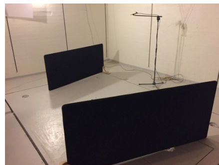
Fig. 2: Measurement setup, ScreenIT A30 1800 x 800 mm