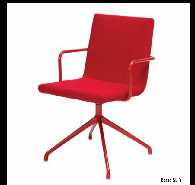
Basso SB Y