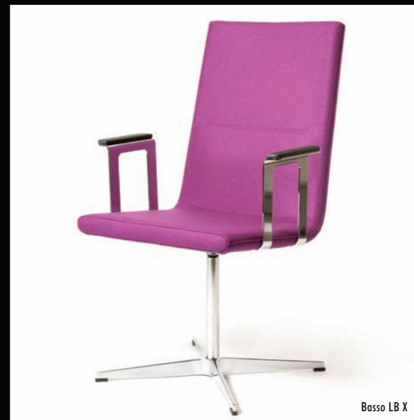
Basso LB X