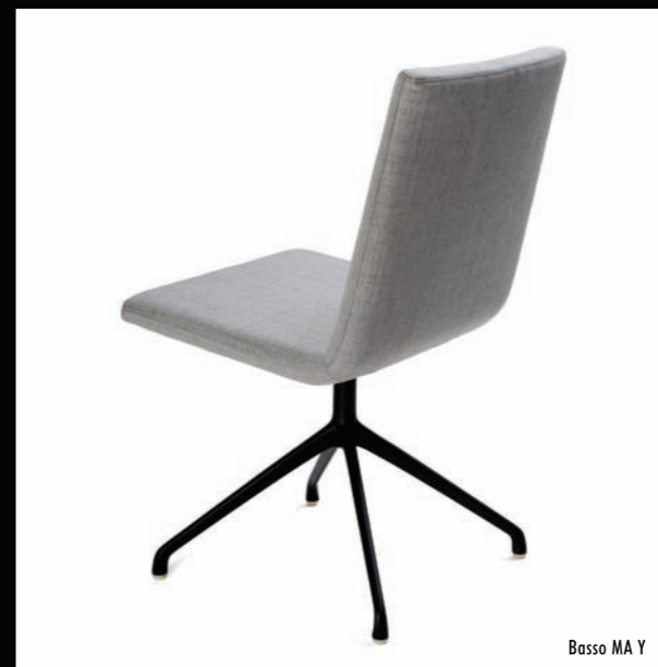
Basso MA Y