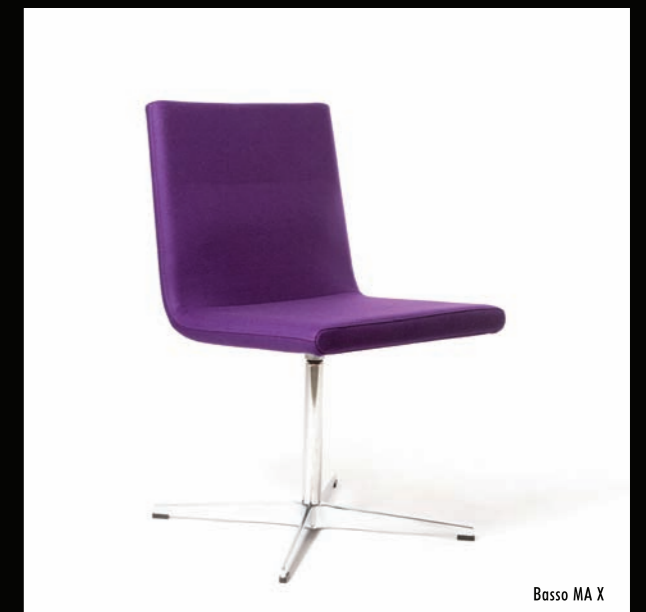
Basso MA X