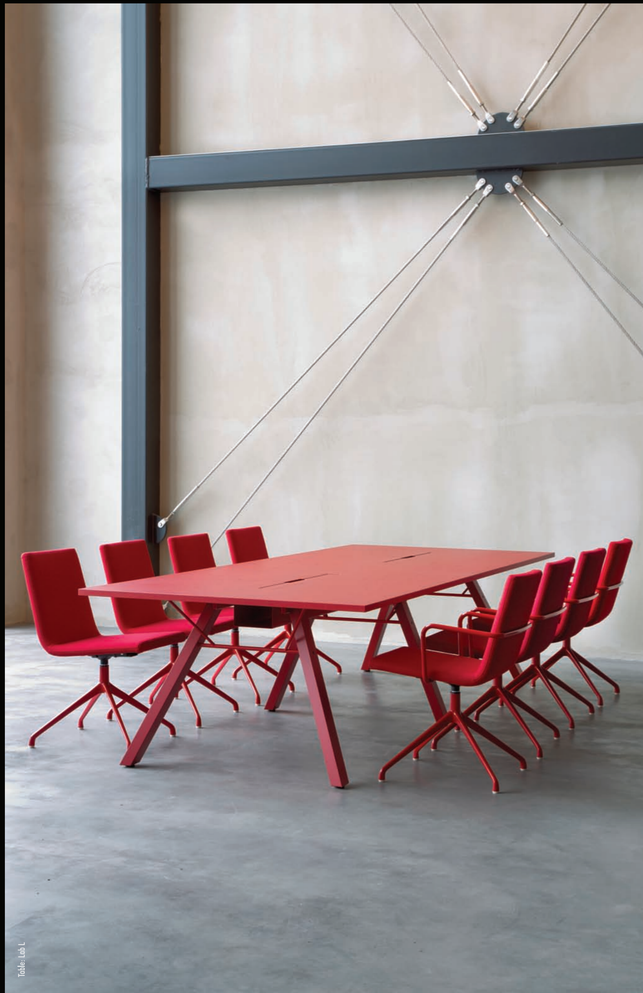
Table: Ltbl L