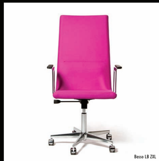
Basso LB ZXL